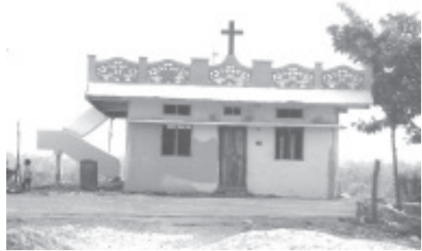
The new Pullaigudem Church

times a year) and appointing of local pastors and evangelists with their related expenses. We constructed 3 church buildings in Pullaigudem, Gattumalla and Vaddugumpu villages.